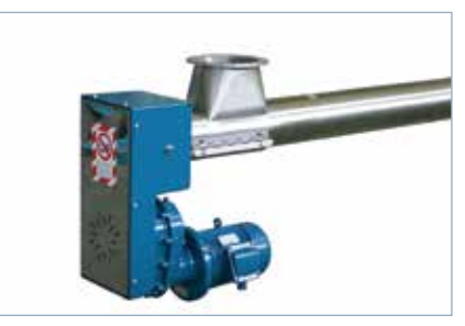
Chain transmission drive