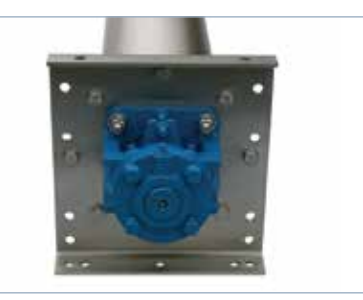
End bearing assembly with adjustable packing gland