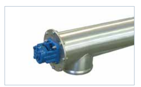
Standard outlet spout