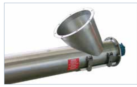
Tapered inlet spout