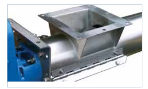
Square or rectangular inlet spouts